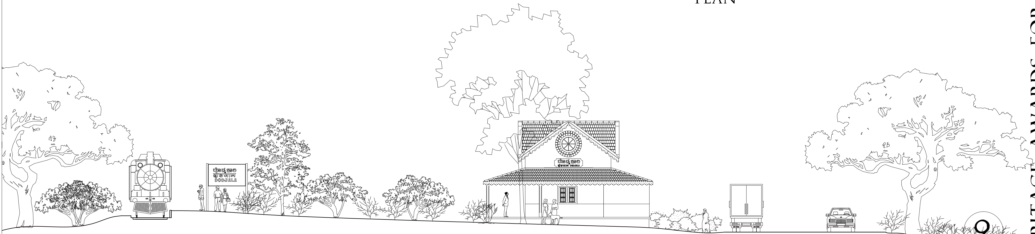
PROJECT SITE LOCATION: DODJALA, MEENAKUNTE HOSUR VILLAGE, BANGALORE - 562157

If the lack of feasibility for the aforementioned solution prevails, one can turn to the adaptive re-use of the structure. As mentioned earlier, function based expansions can be made while the old structure can be converted into community spaces such as a library, a museum or a gallery to facilitate the people's understanding of the cultural and architectural history and heritage of the past.